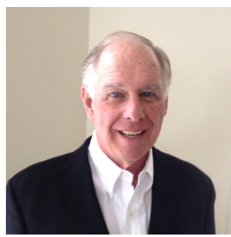
Section Chair's Message: