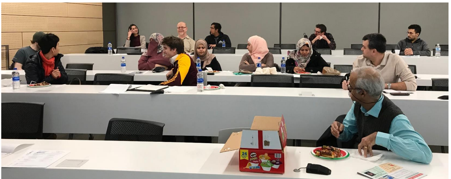
Figure 2) Lively discussion on the topic of cyber security