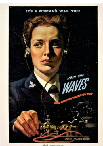
NAVY RECRUITING STATION OR OFFICE OF NAVAL OFFICER PROCUREMENT

Some time ago it was perceiveded that since Morse code is a strictly 'audio' language, with no 'written' literature, it is best taught in the same way one would learn a new verbal language by 'deep immersion' into a culture where that language is the only thing you hear. For Morse code, you learn by hearing the code letter, and immediately saying or hearing its English equalivent. No extra steps between hearing and recoganizing the content.